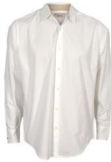
Solid White Dress Shirt